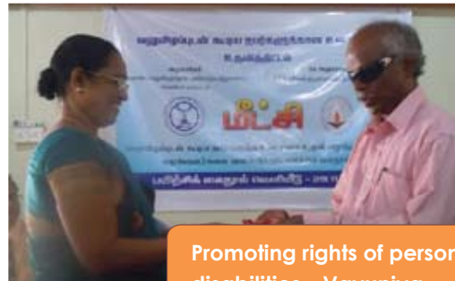
Promoting rights of persons with disabilities - Vavuniya