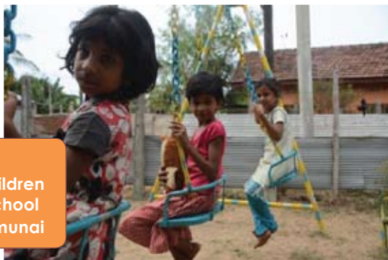
Providing marginalised children access to pre-school education - Kalmunai