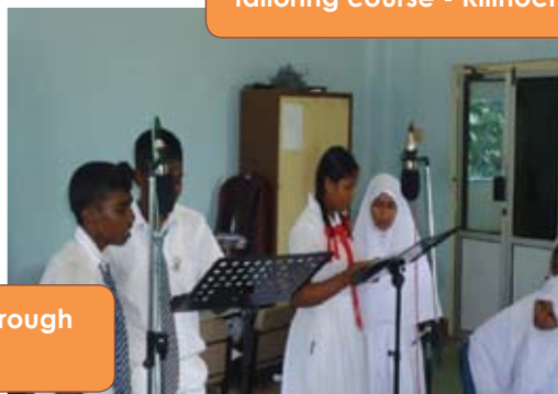
Promoting pluralism through radio dramas - Jaffna