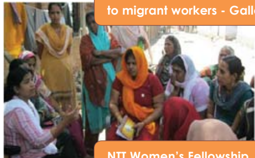
NTT Women's Fellowship Programme - training in India