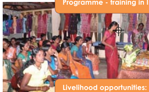
Livelihood opportunities: tailoring course - Kilinochchi