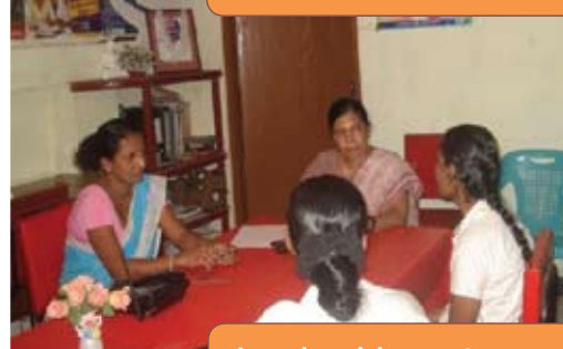
Legal assistance & counseling to migrant workers - Galle